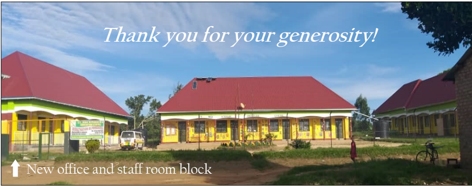
↑ New office and staff room block