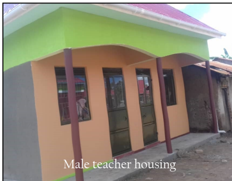
Male teacher housing