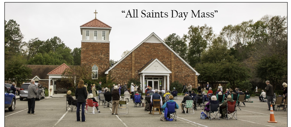
"All Saints Day Mass"