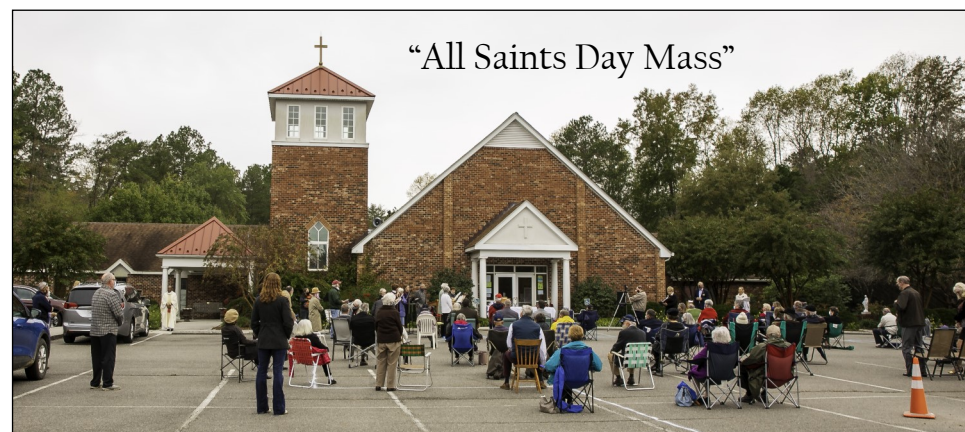
"All Saints Day Mass"