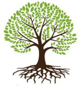
Potential, Purpose, Promise

Everyone, during their lifetime, accumulates "things." Personal property such as vehicles, jewelry, real estate, and savings or other financial accounts all make up the "stuff" we gather during our lifetimes.