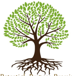
Potential, Purpose, Promise

There's many ways to do this. Some provide better tax advantages than other. There are also ways you can receive a stream of income for life with the church getting the remainder at death.