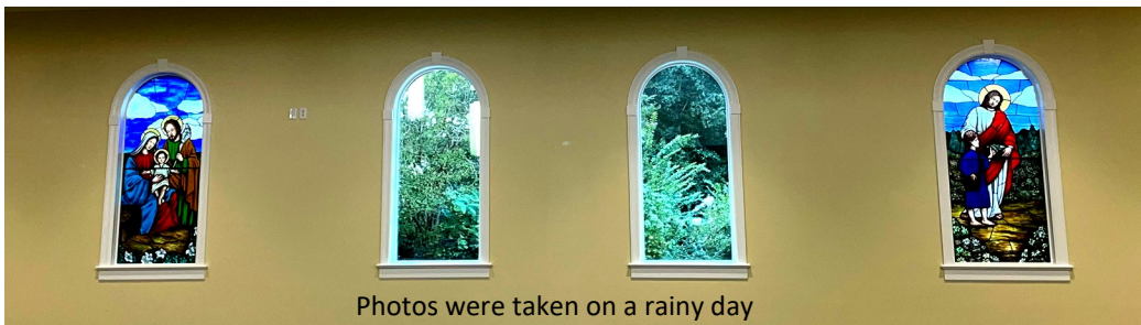
Photos were taken on a rainy day