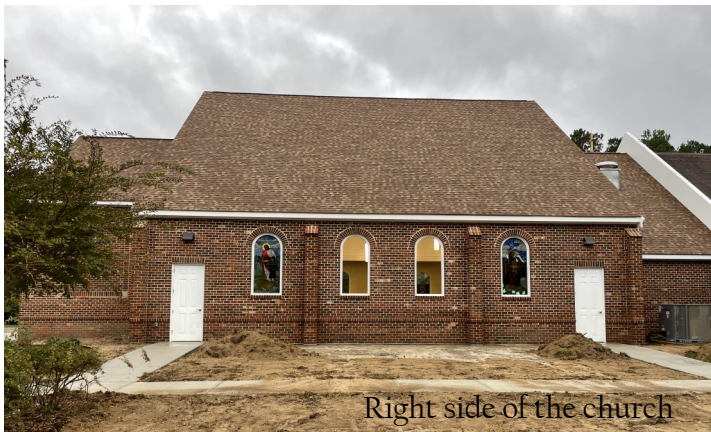
Right side of the church