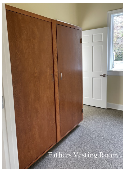
Fathers Vesting Room

Upon reflection about the sale of Memorials, they have had the most significant impact in reducing the size of the loan which we will eventually have when the final bills are received. Initially, we faced a $300k loan, but thanks to our parishioners' generosity and interest in honoring their loved ones, that final number will be reduced dramatically. To pay the most recent contractor's bill, we took our first construction draw for $125k. One more construction bill awaits us, and we will be able to fix the final loan amount. At that time we will be more specific about monthly loan payments, etc.