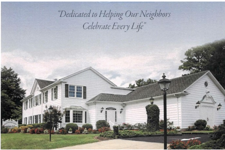
“Dedicated to Helping Our Neighbors Celebrate Every Life”

Faulkner Funeral Homes & Cremation Services