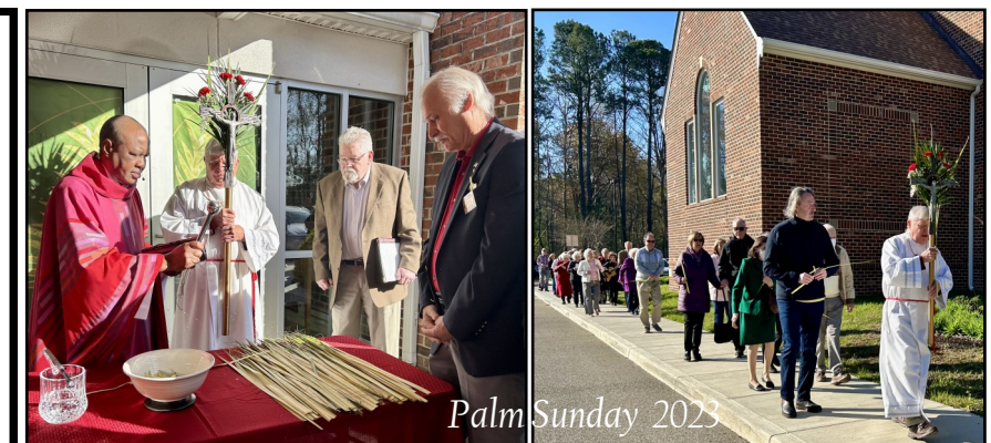
Palm Sunday 2023