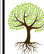
Potential Promise Purpose

Create a list of the ministries you love and support now. Consider your own dreams for those ministries for the future. Next consider all the goals you have (support your family, provide for your own retirement, provide an education for grandchildren, etc.).